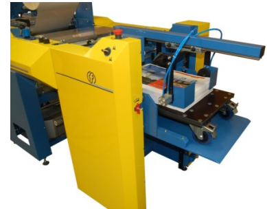
Optional Pallet Stacker